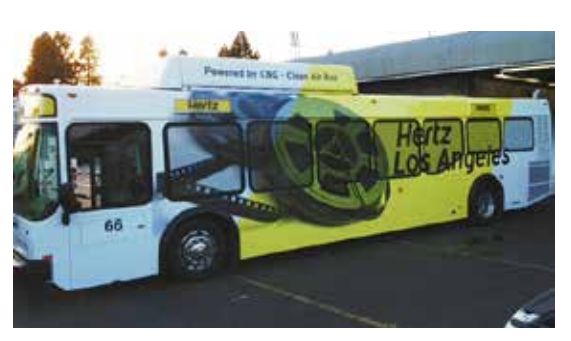
CNG Bus Los Angeles, CA

As part of Hertz' commitment to energy-efficient and cost-effective transportation we're exploring a range of cars and buses that use alternative fuels and technology, such as hybrids, EVs, clean diesel and compressed natural gas (CNG) vehicles.