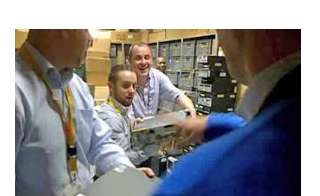
Computers for developing foreign country education

Hertz European Service Center's IT team donated over 1,000 PCs to African schools.