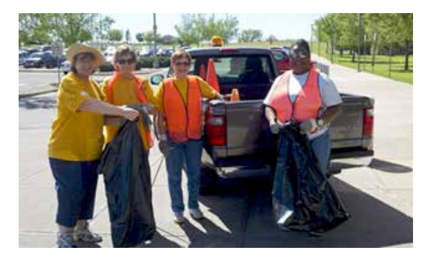
Adopt A City Street - Oklahoma City Employees pick up one mile of trash and recyclables along local Oklahoma City streets.