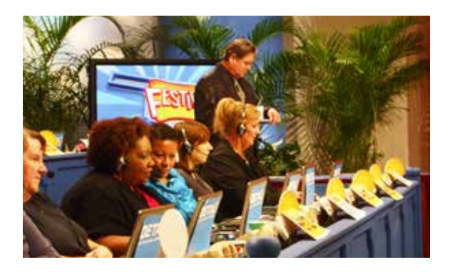
Public Television Support Hertz employees at a local Public Television Network telethon.