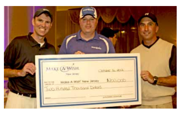
Third Annual Make-A-Wish Foundation® Charity Golf Tournament Hertz employees raised $200,000 to benefit the Make-A-Wish Foundation.

At the Regional Food Bank of Oklahoma City, Hertz employees filled and delivered enough food to prepare 18,946 meals.