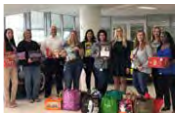
Candy for Troops & Costumes for Kids