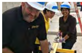
Team Tampa, joined with Habitat for Humanity