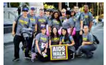
2017 AIDS Walk LA: Hertz employees raised $3,230