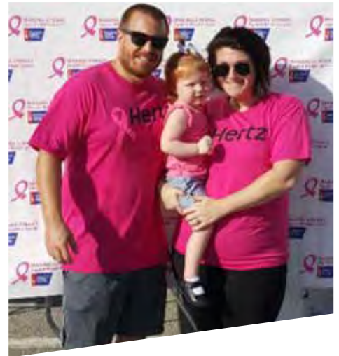
Employees in Estero, Florida, participated in the Making Strides Against Breast Cancer walk with family and friends. The team raised more than $4,000 for the American Cancer Society.