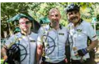
Bike MS: Country Challenge, New Jersey